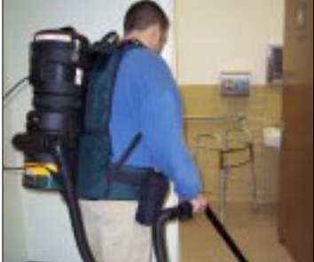
In addition to the enhanced safety benefits of a cordless design, the Pacer PB's quiet operation makes it ideal for healthcare facilities.