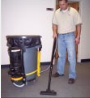
The Pacer PB can also be mounted on a large barrel. Requires 2 Barrel Hangers (#6990781), 10-ft. hose (#6990801), and Accessory Skirt (#6990791).

DISTRIBUTED BY The Vac Shop North, Inc. 7514 W. Belmont Ave Chicago, IL. 60634 (800)353-9991