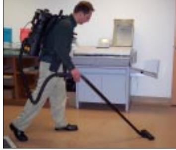
Cordless operation accelerates spot vacuuming in office areas.