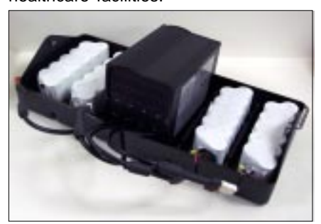
The charger automatically recharges two sets of batteries. It restores 60% capacity in 60 minutes, 90% in 90 minutes, and fully recharges a set in two hours. The tray simplifies staging in large facilities.