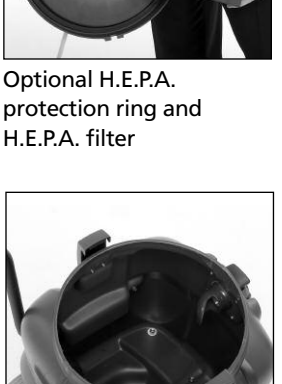
Cyclonic inlet helps knock down foam