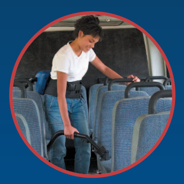
Compared to larger, heavier back vacs, strain on the shoulders, back, and neck is minimized.

Just 6.4 lb and easy to wear; virtually any worker can use Hip Vac so resources are optimized and cleaning time is reduced.