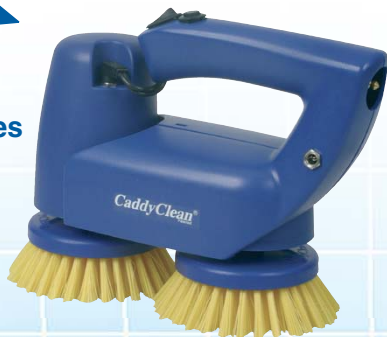
The picture shows Caddy Clean® Standard

Two machines in one - with handle conversion!