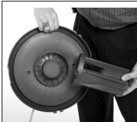
Optional H.E.P.A. protection ring and H.E.P.A. filter