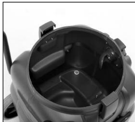
Cyclonic inlet helps knock down foam

50 foot grounded safety yellow power cord